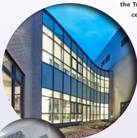
△ Top: nighttime exterior shot of the Orthopaedic Centre at Wrightington Hospital.

When the scheme progressed to build stage, Knights says, further time was saved on-site as build technicians were able to repeat processes and routines to a high standard across the